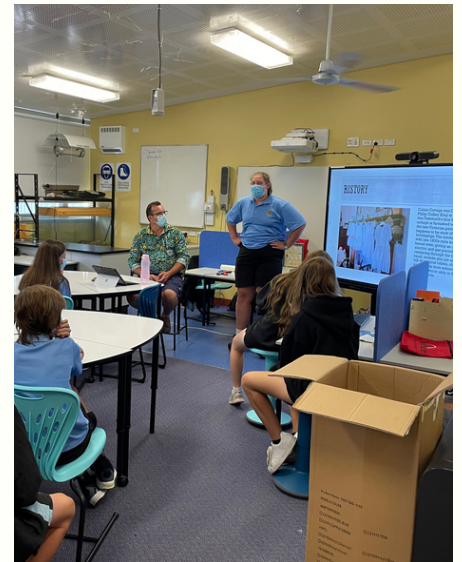
Students researched and presented significant places in the local community..