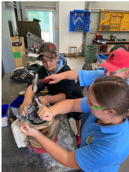
Students dismantling a fire pump to replace some seals and gaskets.

The best part about this term was learning more about students through their exploration of their past, their families and their future ambitions